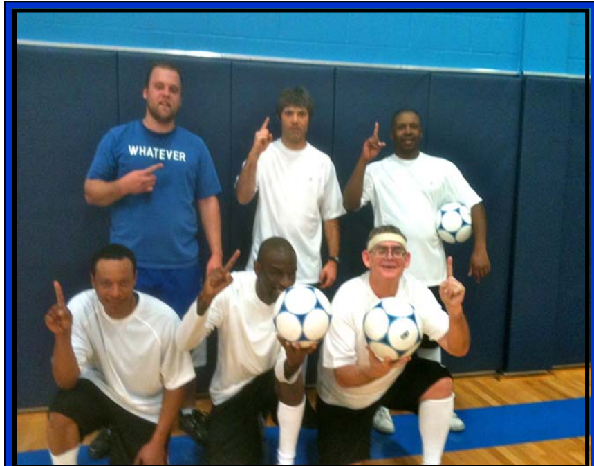
LifeNet's Street Soccer USA Team Just after their first practice.